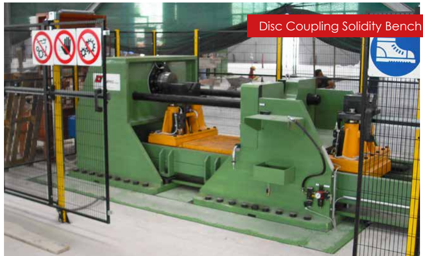
Disc Coupling Solidity Bench

Simpro also provides tailor-made maintenance systems for complete lines or subunits (electro-diesel engine test or maintenance, wagon, wheels/ axle group).